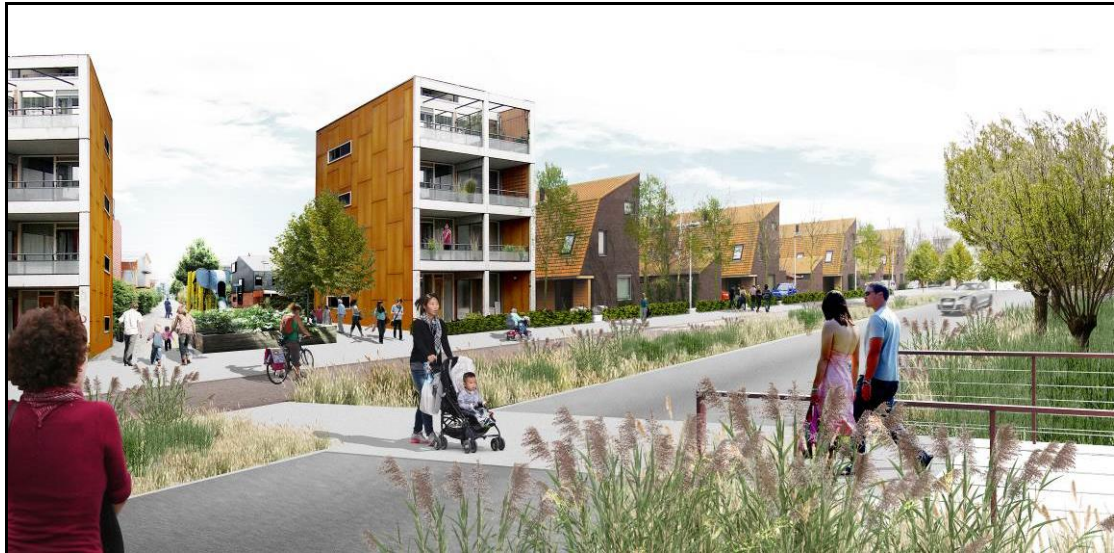
Proposed indicative example of a mix of housing typologies from planning application S/2075/18/OL Prepared by LDA Design on behalf of RLW Estates

In addition, the SPD outlines other vital infrastructure and facilities required to create a successful settlement. These include a multifunctional green network of amenity spaces, onsite healthcare provision, a significant amount of play space for children and young people as well as more formal outdoor sports facilities.