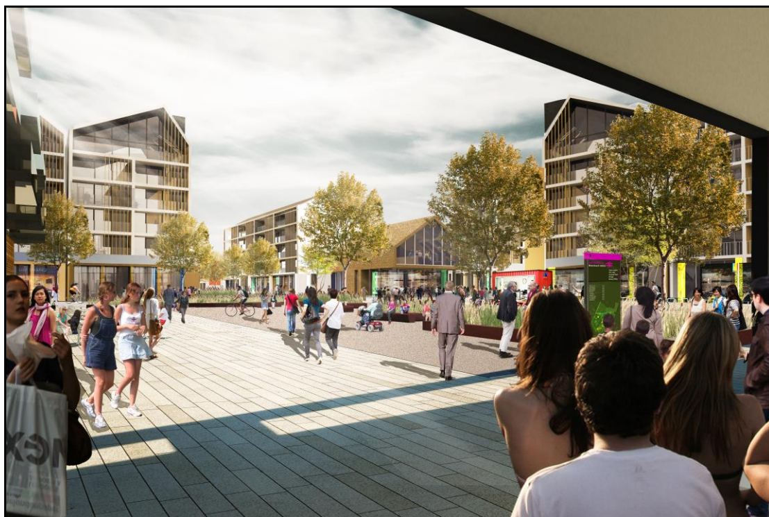
Proposed indicative example of Station Square from planning application S/2075/18/OL Prepared by LDA Design on behalf of RLW Estates

The relationship between the new town and the existing village will be controlled and managed to the mutual benefit of both. New residents will want to use existing village shops and pubs and village residents will want access to the shops, services, schools and open spaces of the new town.