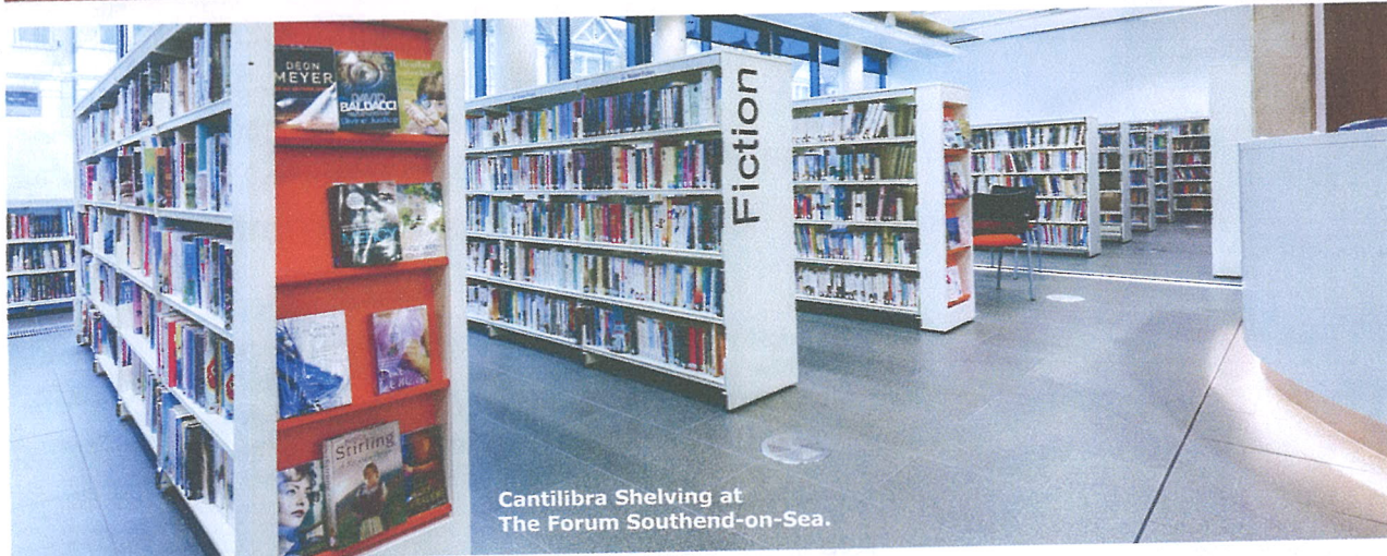
Cantilibra Shelving at The Forum Southend-on-Sea.

The school and college library plays an ever increasing role in shaping the future of our students. An attractive library space can create a destination for students, attracted by a modern library with new furnishings, learning materials, technology and services. It's no secret that young people can be put off by the negative stereotypes of quiet, dingy libraries but now is the time to reconnect with your students and create modern, comfortable and welcoming library interiors with new furnishings and technology.